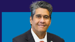
HE PRESIDENT SURANGEL WHIPPS JR* Head of Government, President of Palau