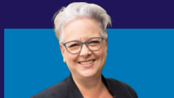
THE HON PENNY SHARPE Minister for the Environment; Heritage; Climate Change; Energy