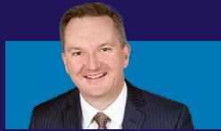
HON CHRIS BOWEN MP Minister for Climate Change and Energy