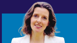
ALLEGRA SPENDER MP Member for Wentworth