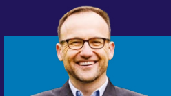
ADAM BANDT MP* Leader of the Australian Greens